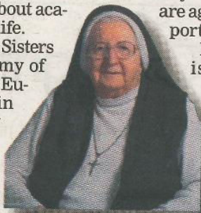
Todd Sargood/SSMO Corp.

But let's remember our dedicated women religious year round. Plan a visit. Write a note. Send a check. Frankly, we owe them.